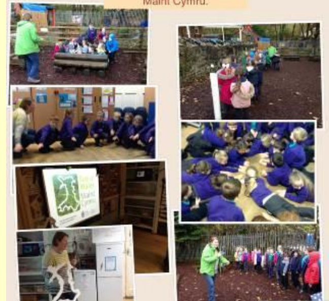
Gwasanaeth a gweithdy Maint Cymru.