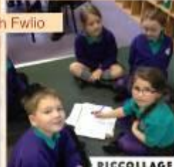
Gweithgareddau Gwrth Fwlio