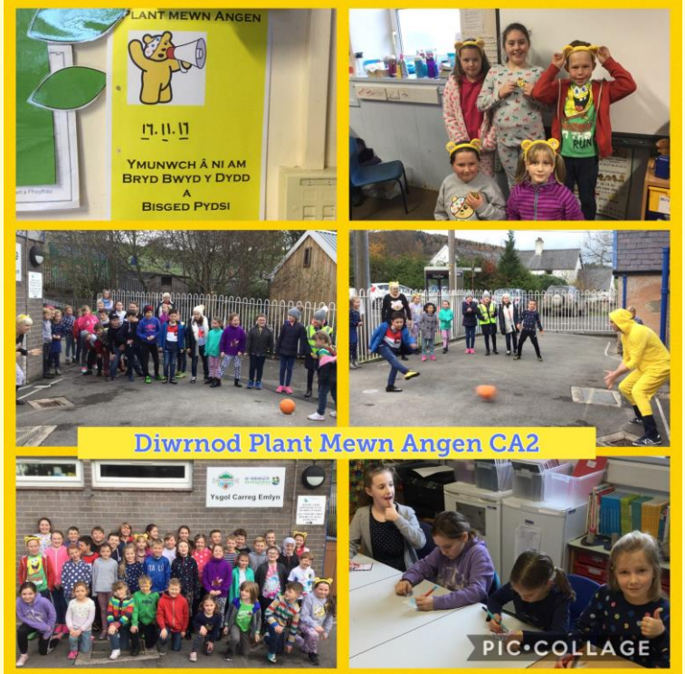
Diwrnod Plant Mewn Angen CA2